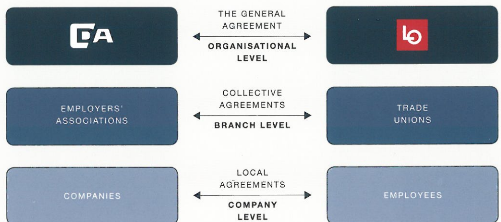
Figure 3 THE DANISH LABOUR MARKET MODEL

The General Agreement does not cover professional and managerial staff graduated from universities.